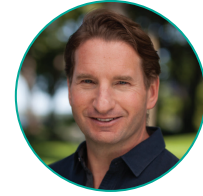
U.S. Rep. Dean Phillips