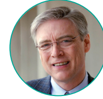
Former U.S. Rep. Tim Penny