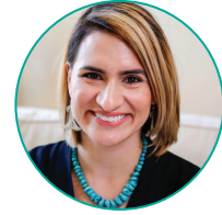
Lt. Gov. Peggy Flanagan