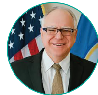
Gov. Tim Walz