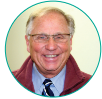
Former Gov. Arne Carlson