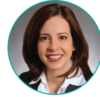
Sen. Melisa Franzen