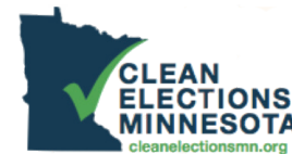
Minnesota Citizens for Clean Elections